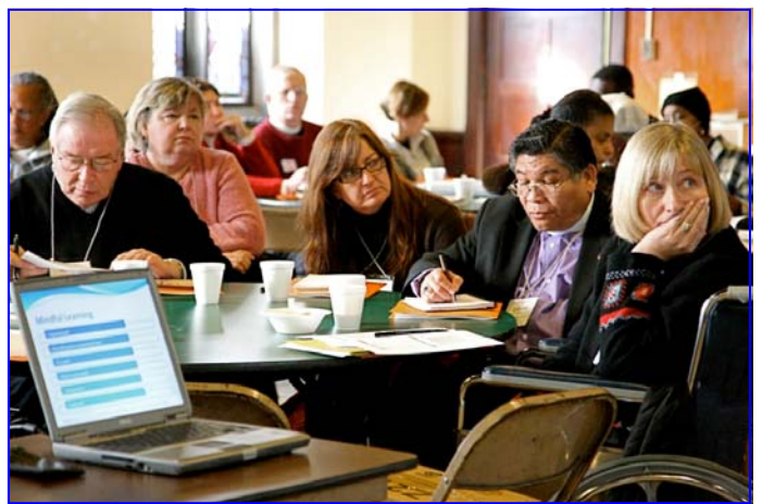
Passion & Purpose: The Heart of Christian Formation, held on 17 January, had some 90 participants from around the diocese.

St. Barnabas Church in Monmouth Junction is located at 142 Sand Hill Road, one mile from Rte. 27 and ½ mile from Rte. 1. Ample parking is available. For more information, please call 732-297-4607 or log onto www.stbarnabas-sbnj.org .