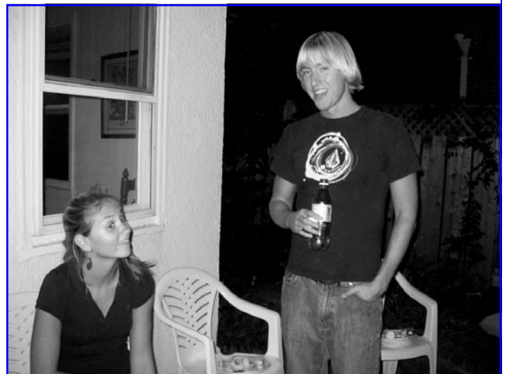
Students relaxing at Canterbury House at Rutgers.