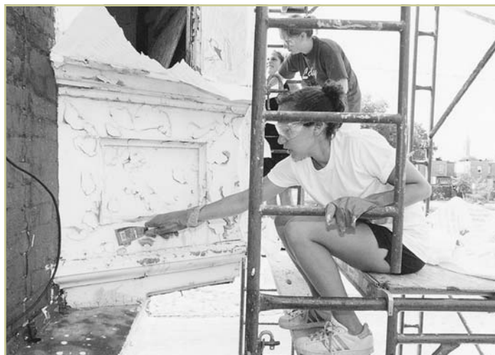
Students from Rowan University working on a house for Habitat for Humanity.