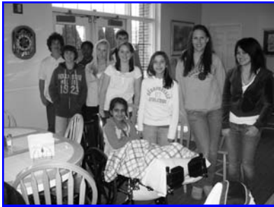
Youth and young adults from Trinity Church, Moorestown at the Ronald McDonald House in Camden.

Go to www.newjersey.anglican.org/campusministry.php for info on campus ministries in diocese.