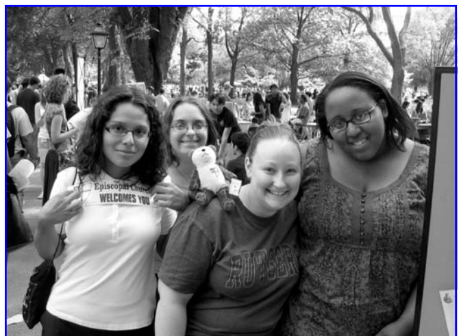
Posing for the camera! Members of the Episcopal Campus Ministry at Rutgers.