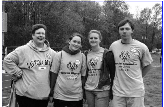
Young adults from Trinity Church in Moorestown volunteering at the Special Olympics Track and Field.